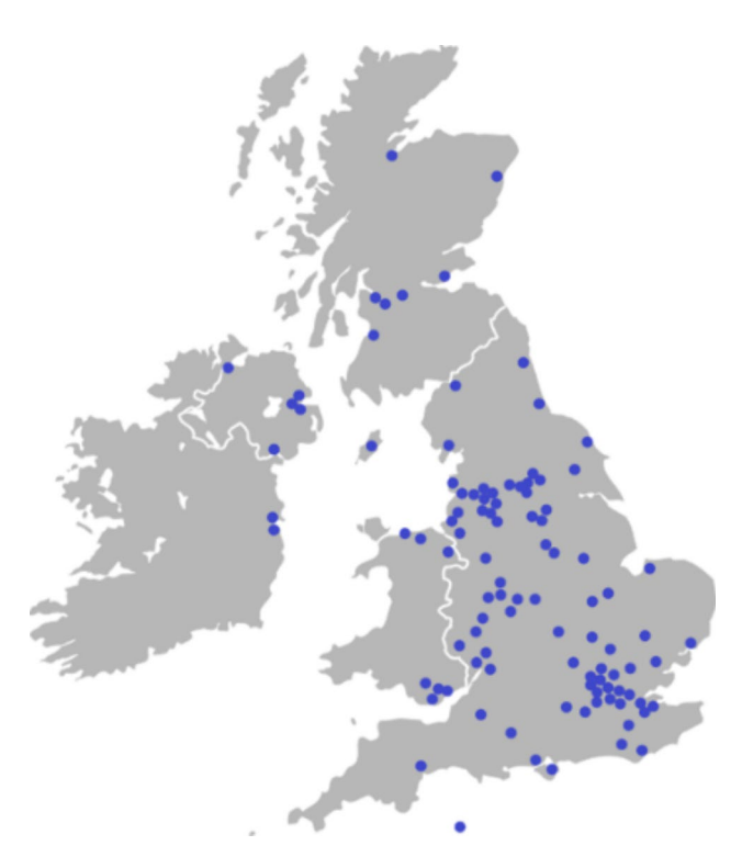
Fig. 1 Survey respondent location as shown on a map of the UK & ROI

Bradley et al. BMC Palliative Care (2022) 21:170 Page 5 of 12